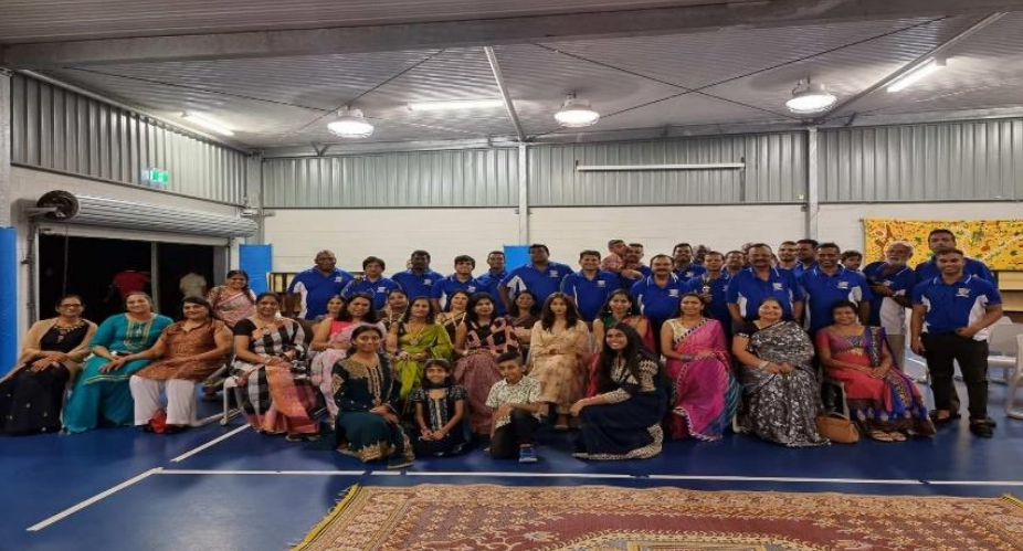
Ipswich Faag Mandali - Group