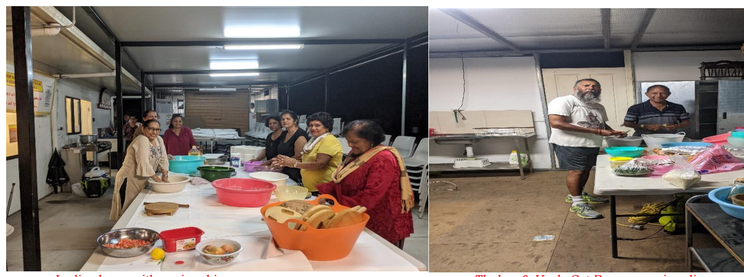
Ladies busy with puri making

Some Clips to share (view more photos on https://www.sanatanqld.org.au