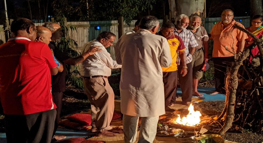
Preparing for Holika Staphna at Sanatan Centre