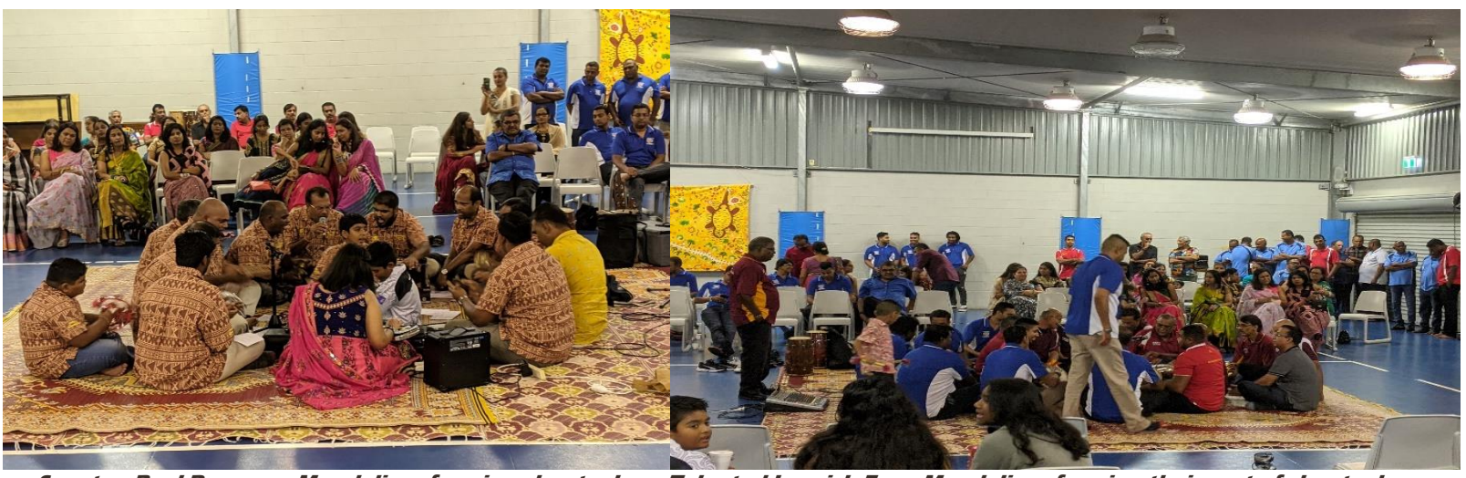
Sanatan Baal Ramayan Mandali performing chautaal