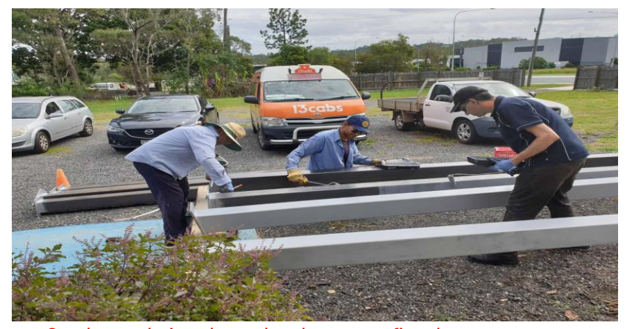
Steel posts being cleaned and rust proofing done.....