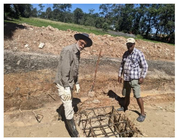
Gone in place