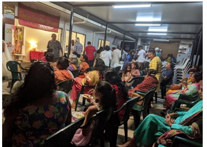
Holika Dahan pooja