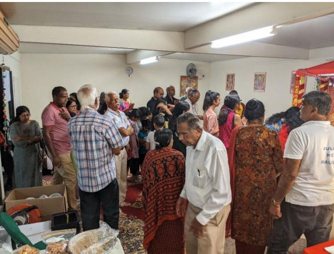
Aarti – Holika Dahan